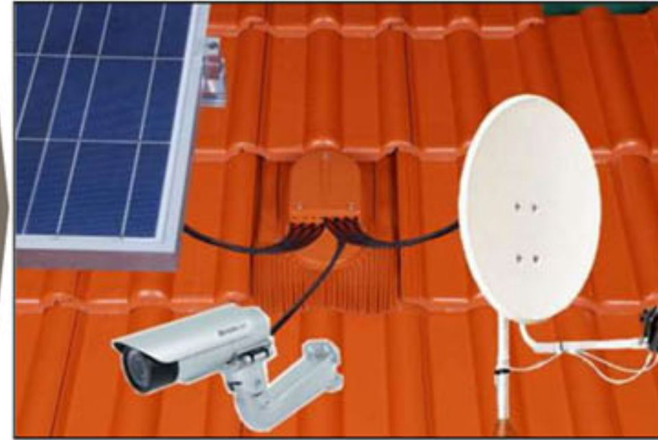
Professional lead-through for cables of all types

A professional solution is now available.