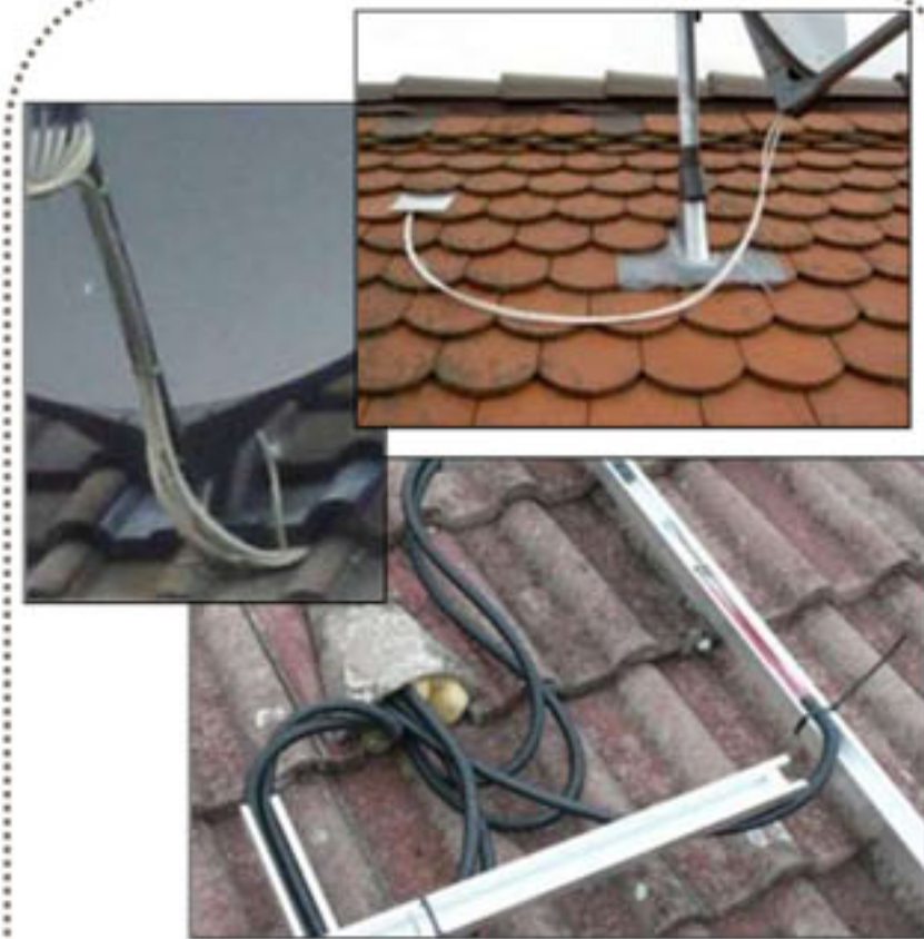
Today's solutions for cable lead through: Handmade solutions, poor sealing

Currently weak handmade solutions with poor sealing used.